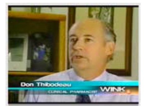
Sample photos for marketing materials.